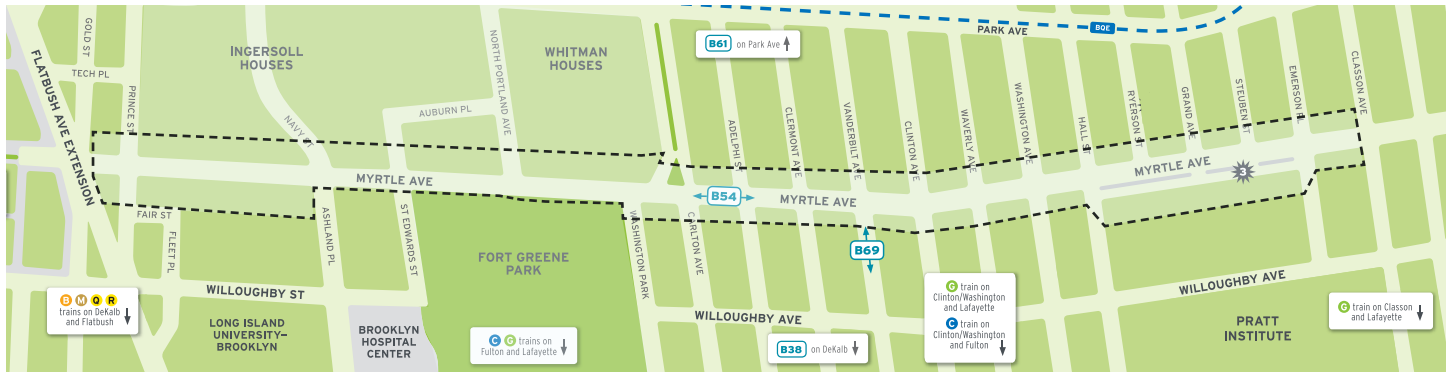
Myrtle Avenue Brooklyn BID Boundaries

This packet provides an overview of the services we provide to businesses along Myrtle Avenue between Flatbush Avenue Extension and Classon Avenue. Many of these services are paid for by a property tax assessment, collected by the City from local property owners, intended for reinvestment right here in our commercial district.